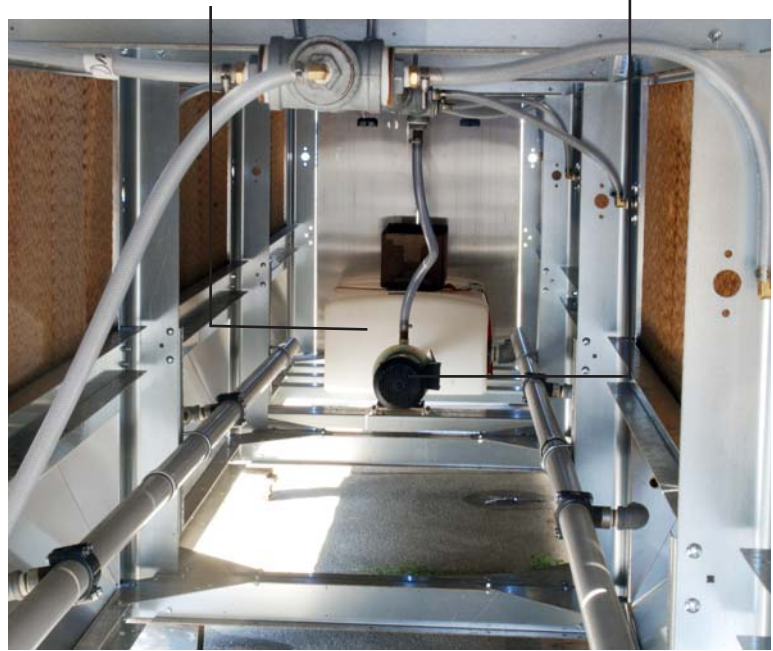
Internal view of Hydra II Fluid Cooler

Centrifugal Pump distributes water to wet media.